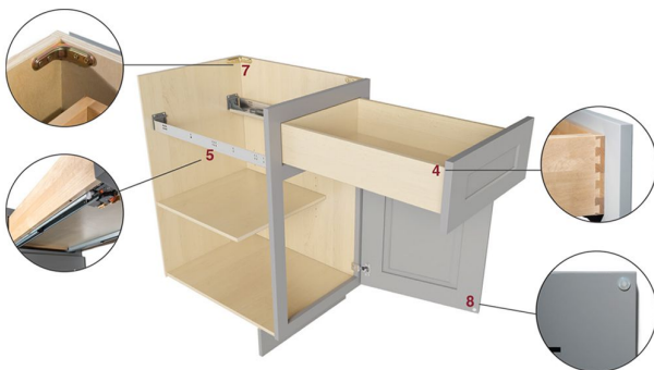
Base Cabinet with one drawer and one door in Castle Grey (S5).

All J&K's cabinets and vanities are superiorly constructed with 100% solid wood and proudly come with the following STANDARD features: